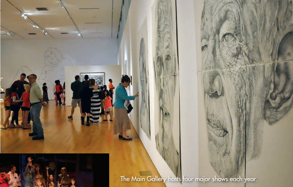
The Main Gallery hosts four major shows each year.