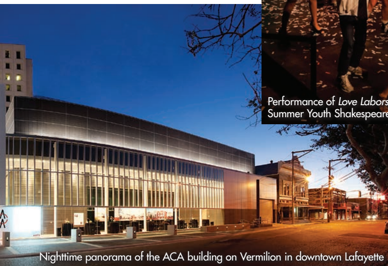
Nighttime panorama of the ACA building on Vermilion in downtown Lafayette

Acadiana Center for the Arts, 101 W. Vermilion St., Lafayette, LA 70501, Hours: Mon.-Sat., 10 a.m.-5 p.m., 337-233-7060, www.acadianacenterforthearts.org