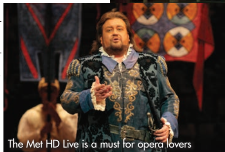
The Met HD Live is a must for opera lovers

of the art sound and lighting, this world class theater is now home to a lively mix of performances.