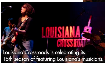
Louisiana Crossroads is celebrating its 15th season of featuring Louisiana's musicians.