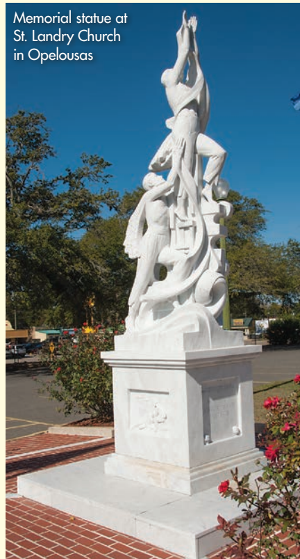
Memorial statue at St. Landry Church in Opelousas