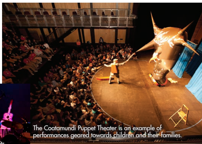
The Coatamundi Puppet Theater is an example of performances geared towards children and their families.