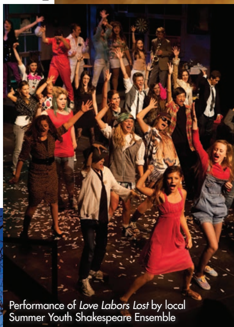
Performance of Love Labors Lost by local Summer Youth Shakespeare Ensemble