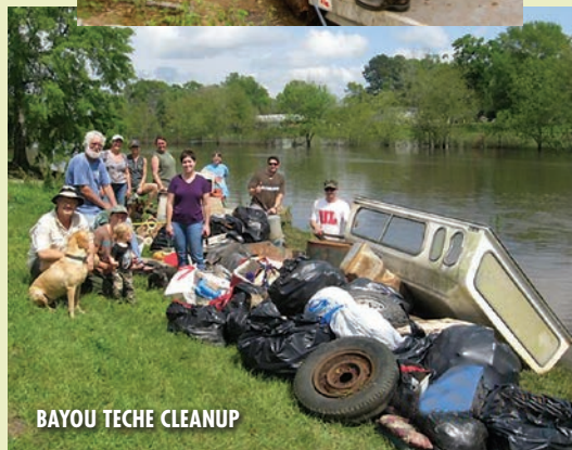
BAYOU TECHE CLEANUP