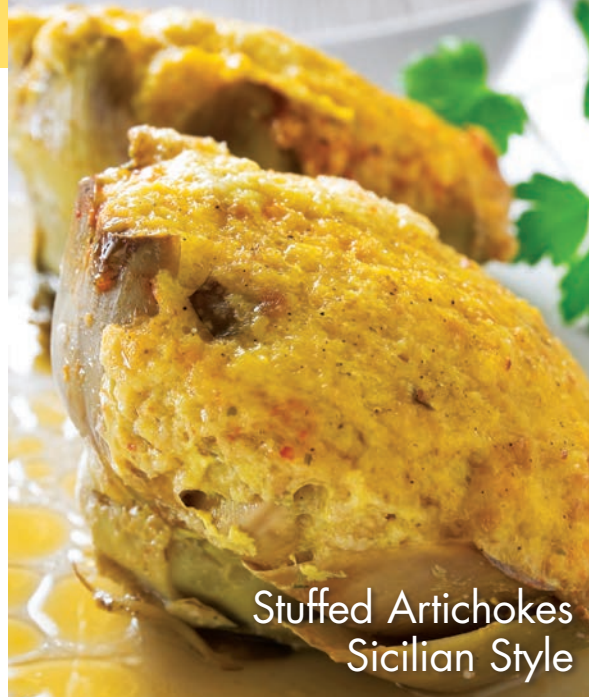
Stuffed Artichokes Sicilian Style

4 medium-sized artichokes juice of 1/2 lemon 1 cup fine bread crumbs 3/4 cup grated goat or Parmesan cheese (reserve 1/4 cup for topping) 2 cloves garlic, minced 3 tsp. chopped parsley 1 tsp. kosher salt 1 tsp. ground peppercorn 1/4 tsp. salt (for salting water) 1/2 cup olive oil, divided