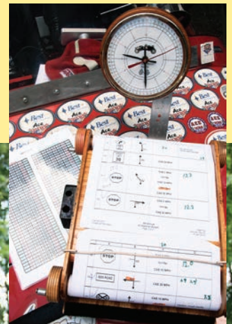
Competitors use speedometer and clock to follow a route chart with split-second precision.