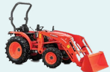
KUBOTA 3901 TRACTOR

with implements provided by Henderson Implement & Marine