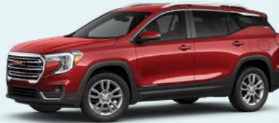
2022 GMC TERRAIN SLE