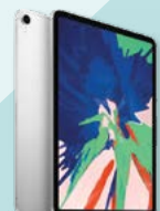
APPLE IPAD PRO WITH WIFI 12.9 Inch

*Actual models may vary depending on supply chain availability