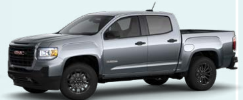
OR 2022 ELEVATION CANYON