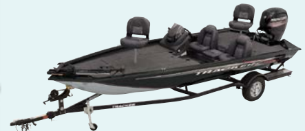
TRACKER BASS BOAT

provided by Henderson Implement & Marine