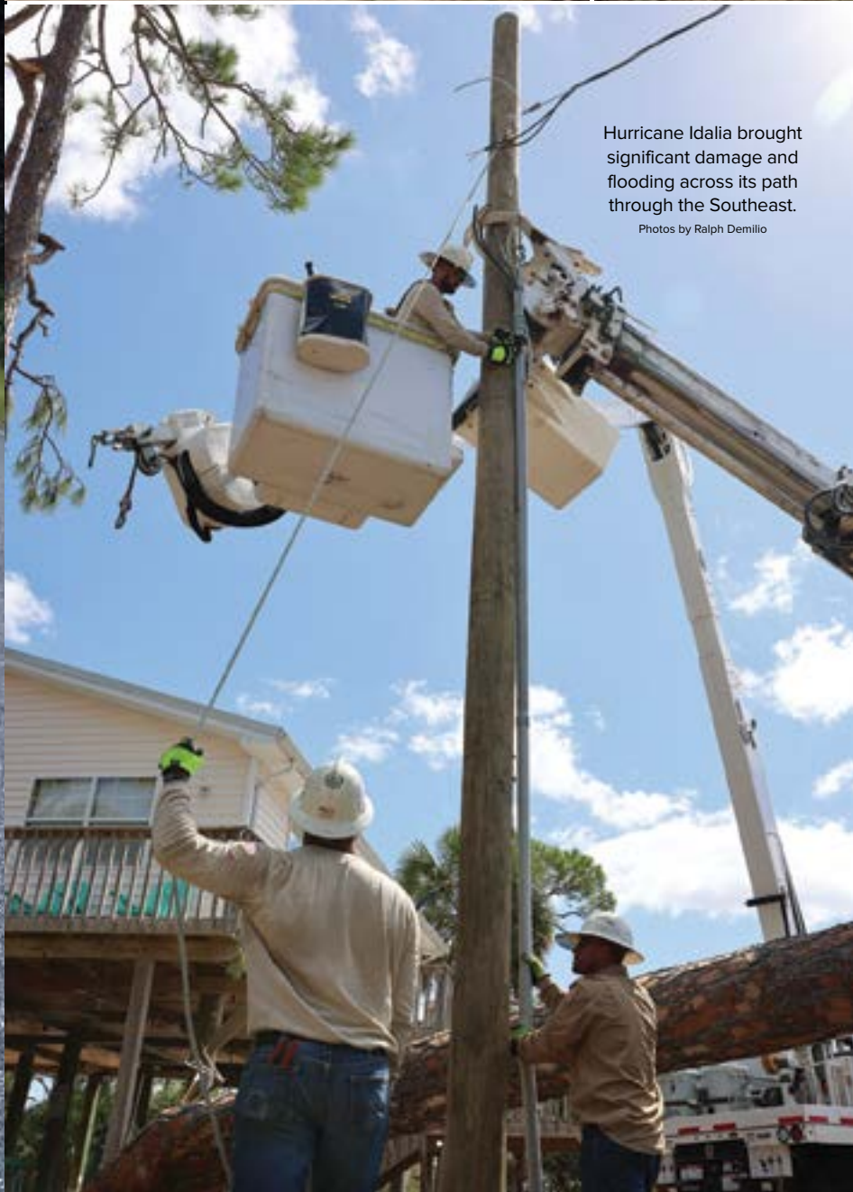
Hurricane Idalia brought significant damage and flooding across its path through the Southeast.

SLEMCO's Storm Response Team includes 32 employees and more than 20 line trucks, pickups, trailers, excavators and other off-road equipment. Lucky Number: 4517625701.