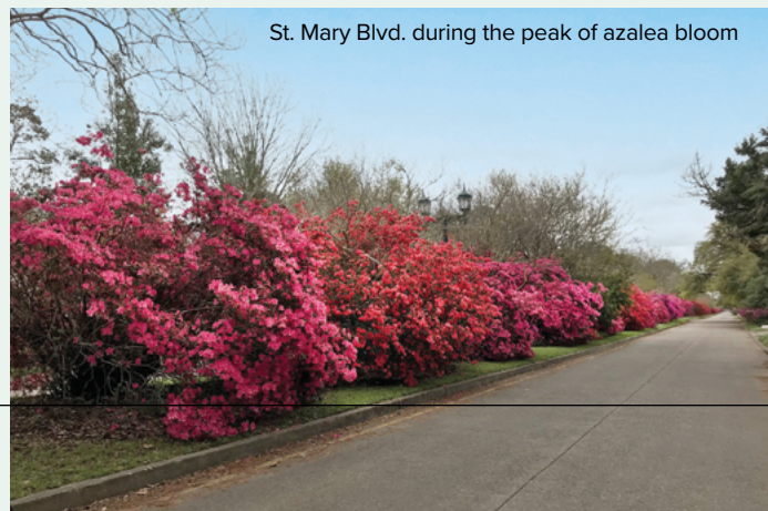
St. Mary Blvd. during the peak of azalea bloom