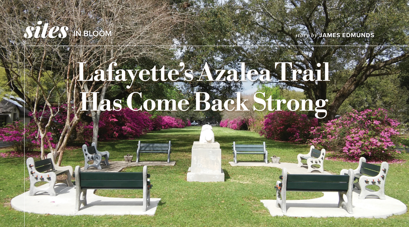
Mouton Gardens, recently revived to its prior-century beauty, shows best during azalea season