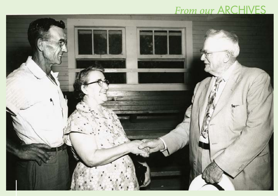
As SLEMCO's Rural Power Magazine would note in a posthumous tribute in February 1961: "He threw himself wholeheartedly into the task of 'selling' the idea of an electric cooperative to farmers of his area. This was not an easy job...because most farmers had to be educated first to the advantages of electricity—they were that remote from it."